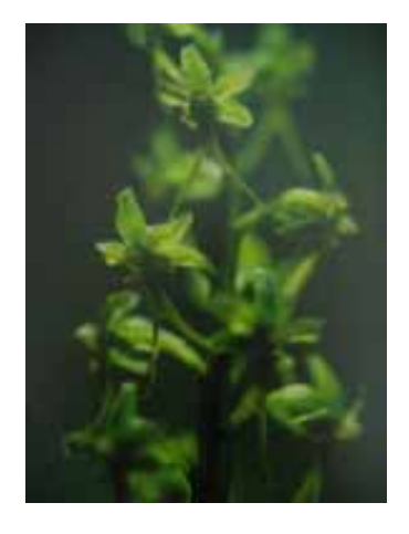
217.1-2: a few purple-lipped twayblades, over which Ada crooned as she did over puppies or