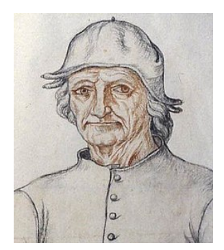
Hieronymus Bosch https://en.wikipedia.org/wiki/Hieronymus Bosch

Dan Veen's favorite painter Hieronymus Bosch (real name Hieronymus van Aken, (1450-1516), was the Dutch painter of The Garden of Earthly Delights , which will be referred to extensively in Part II Chapter 9, and The Last Judgment , as well as The Ship of Fools .